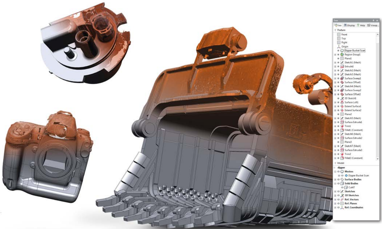
A parametric solid models created in Geomagic Design X

Save significant money and time when modeling as-built and as designed parts. Deform an existing CAD model to fit your 3d Scans. Reduce tool iteration costs by using actual part geometry to correct your CAD and elimination part springback problems. Reduce costly errors related to poor fit with other components.