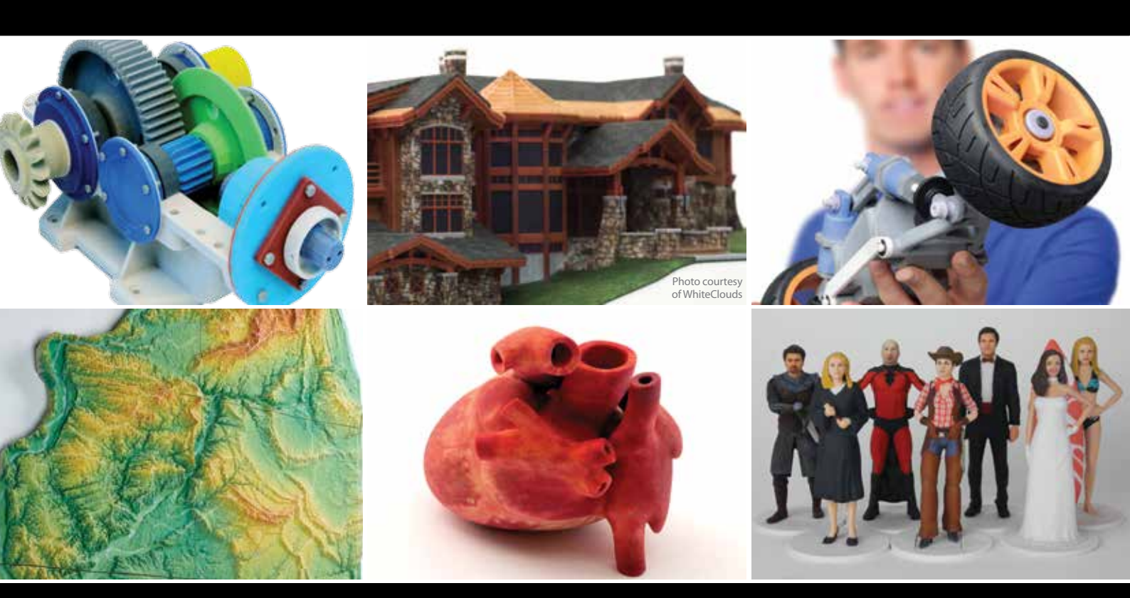
High throughput for high volumes of high-resolution full-color realistic models and prototypes.