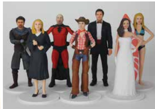
High throughput for high volumes of high-resolution full-color realistic models and prototypes.